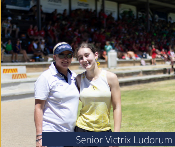
Senior Victrix Ludorum