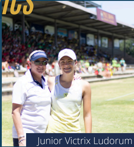
Junior Victrix Ludorum